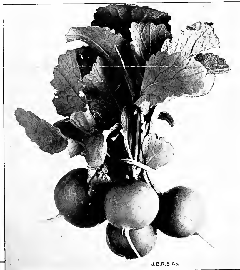
J. B. R. S. Co.

(Special.) Our Big Boston Lettuce Seed is grown for us by one of the most careful firms of seed growers in the world. They take the utmost pains in pedigree breeding from individual plant selection. Their Big Boston does not run to seed and makes very large, firm heads, which blanch to a beautiful golden color, and every plant makes a head. It heads best in the cool weather of early spring and late fall. We do not recommend it for the hot summer months. Oz., 20c; ¼ lb., 60c; 1 lb., $2.00, postpaid.